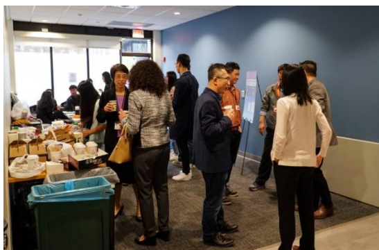
Networking during break