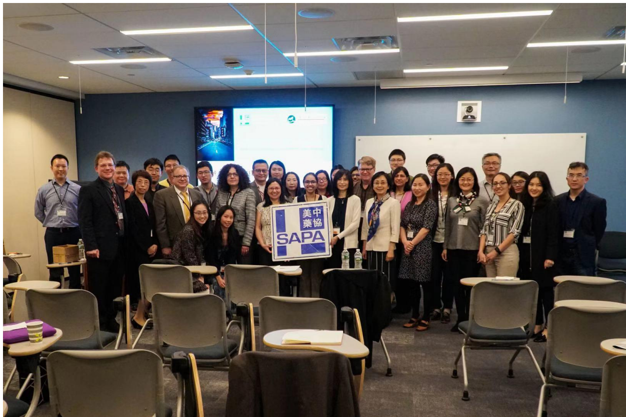
Group photo of speakers and organizers