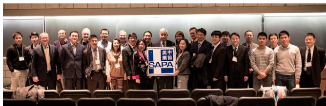
Figure 6. Speakers, volunteers, and EC members celebrated the success of the symposium.

This one-day conference has proven itself fruitful in many aspects: more than 200 attendees (thirty percentage increase over last year; Fig. 5), distinguished speakers with inspiring presentations on innovation and community service, career development forum engaging Ph.D. students, post-doctoral researchers, and biopharma professionals, and entrepreneur spirit incubating next wave of biopharmaceutical start-ups (Fig. 6). To continue our commitment in serving the community, SAPA-CT will host serials of workshops, career development forums, and outdoor gathering/BBQ through the year. We will also work closely with CURE, Chinese Association for Science and Technology-Connecticut (CAST-CT), Chinese American Professors Association (CAPA-CT), the US-China Center and other organizations to promote the awareness of bioscience in local community. Please visit our website for frequent updates ( www.sapa-ct.org ).