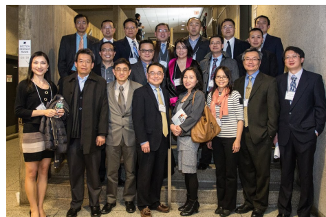
Figure 7. Leaderships from HQ, NE, GP, and CT were well united at SAPA-CT 2 nd Annual Conference.

We will also work closely with CURE, Chinese Association for Science and Technology-Connecticut (CAST-CT), Chinese American Professors Association (CAPA-CT), the US-China Center and other organizations to promote the awareness of bioscience in local community. Please visit our website for frequent updates ( www.sapa-ct.org ).