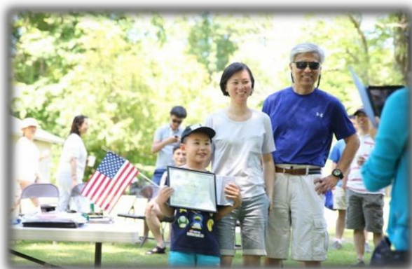
Figure 6: Hiking competition winners.