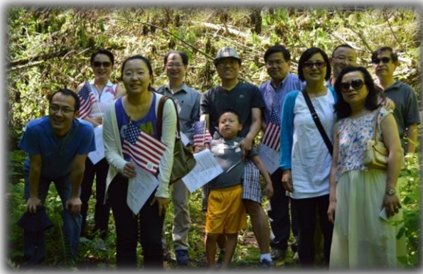
Figure 1: A group of energetic SAPA-CT members and friends participated in the hiking competition and raced for the prizes.

Having successfully hosted its first annual meeting in February and the drug discovery and development workshop in May this year, the newly established SAPA –CT chapter organized a BBQ party during the Independence Day weekend, at the beautiful Emery Park in Kent, CT.