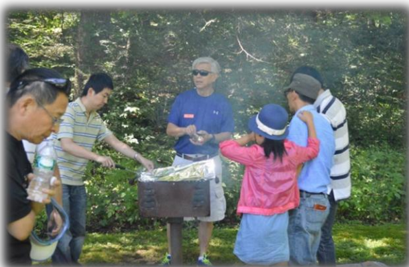
Figure 2: What's for lunch? A great variety of delicious food and ... BBQ!